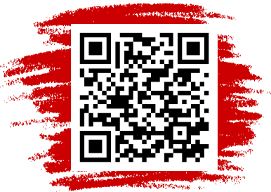
Miller Library Website

Monday-7:30 a.m.-12 a.m. Tuesday-7:30 a.m.-12 a.m. Wednesday-7:30 a.m.-12 a.m. Thursday-7:30 a.m.-12 a.m. Friday-7:30 a.m.-5 p.m. Saturday-10 a.m.-2 p.m. Sunday-2 p.m.-12 a.m.