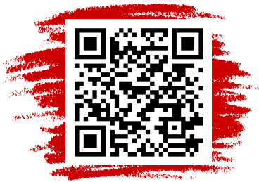
Service Hour Form

Students are encouraged to submit any service hours they complete throughout the year at https://forms.office.com/r/QVpn1nLfNB .