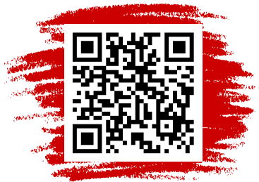
Missions Fund App

The Dean of Students (or designee) will administer the funds and make awards in consultation with the Vice President for Advancement. Applications are due in February but may be made at other times during the year. More information and the application are available at https://forms.office.com/r/pNFuZyqHS1 .