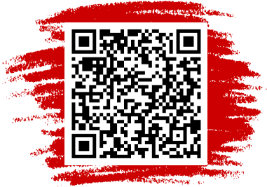
Disability Services Website

Current or incoming students, who have either a temporary or permanent disability, are welcome at McPherson College under the regular admissions requirements. These students are urged to inform the College of their disability and needs before their arrival on campus to allow them time to determine necessary resources and accommodations. Additionally, accommodation requests though can be made at any time during the academic year. Located on the main floor of Miller Library, the college's Academic Disability Services offices provides academic accommodation services for students with verified disabilities. Information is available at: https://www.mcpherson.edu/academics/academic-disability-services/ and via email to barrettl@mcpherson.edu .