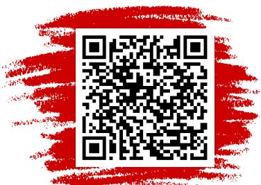
Sexual Harassment Incident Report