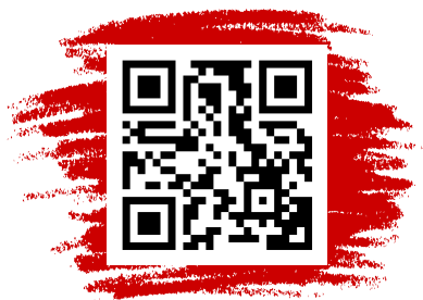
Debt Project Signup

Students in the program engage in monthly financial literacy-focused seminar sessions and optional financial freedom clinics that offer advanced financial tools. Students earn a $0.25 match by doing 3 things: 1) Working during school and/or breaks, 2) Making payments from work directly to their student account, and 3) Submitting paystubs or proof of earnings (direct deposit screenshot, etc.) for employment verification via an online form. Students will receive more details via their college-issued Outlook email (bulldog email) about the program and events as well as via the Debt Project course on Bulldog Connect. Questions may be directed to debtproject@mcpherson.edu .