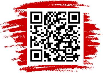
Event Request Form

All campus events that require the use of campus facilities (academic, social, athletic, or organizational meetings) sponsored by students, faculty, and staff must be scheduled by submitting a space reservation request. Clubs and Orgs should submit for event approval at this link: https://forms.office.com/r/SX1yupwKAs .