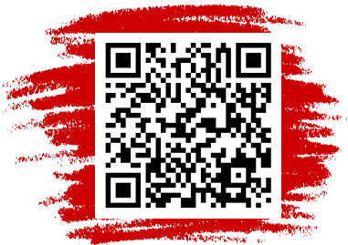
Parking Permit Request

Request a Parking Permit here: https://recruit.mcpherson.edu/register/vehicle .